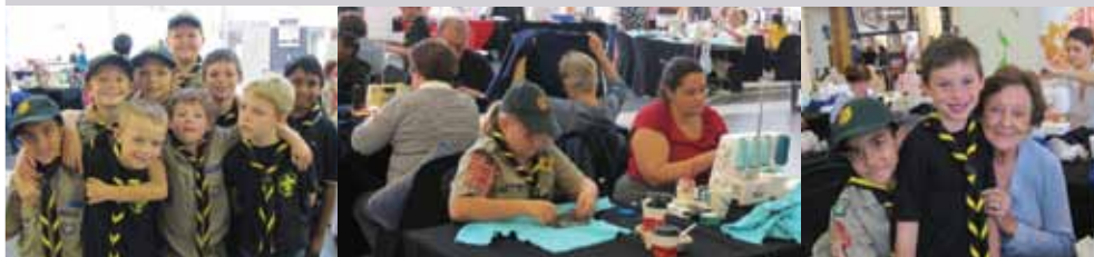
1st Glenashley Journey's End cubs assist with an underprivileged orphanage project at Gateway.